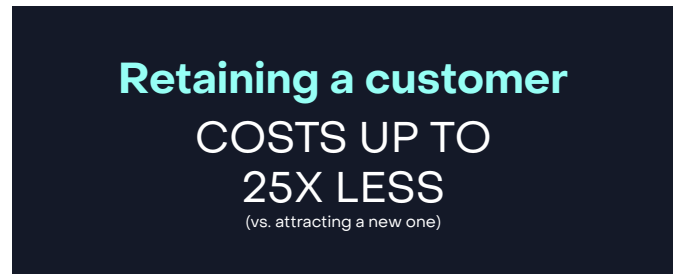
* The value of keeping new costumers. Amy Gallo, 2014. Harvard Business Review

Customer retention is one of the prime benefits of great customer service. Customer retention translates into both immediate cost savings and increased long-term profitability. In fact, according to Harvard Business Review, attracting a new customer is anywhere from 5 to 25 times more expensive than retaining an existing one. What's more, increasing customer retention rates by just 5% could potentially increase profits anywhere from 25% up to 95%.